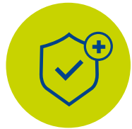
IEC TR 61641 Arc ignition protected zones