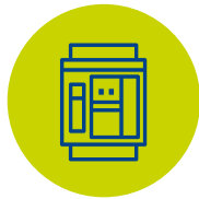
ACB Stacking up to 4 MTZ1 devices (1000A each) up to 4000A per column