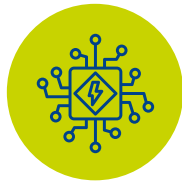
Intelligent Motor Controls (iPMCC) – integration with client control systems